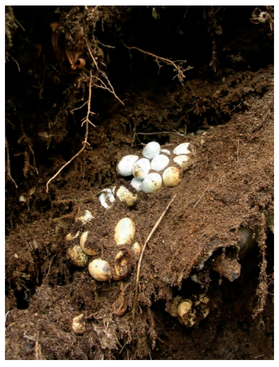
Figure 2. Grass snake eggs in decomposing timber.

Submitted by: JOHN BAKER, Amphibian and Reptile Conservation, 655a Christchurch Road, Boscombe, Bournemouth, Dorset, BH1 4AP.