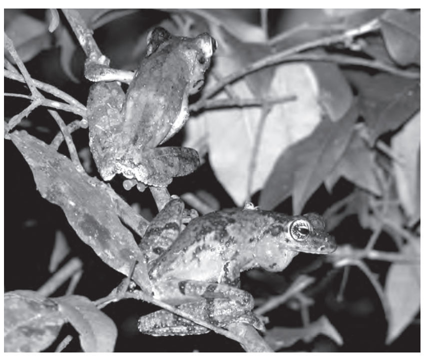
Figure 1. Itapotihyla langsdorffii males after combat, Cerrado habitat, southeastern Brazil.

(Faivovich et al., 2005). Male-male combat among amphibians is common especially due to disputes over territories or mates and includes aggressive and violent fights (Wells, 2007). The most violent combat among anurans is reported for gladiator frogs, Hypsiboas boans group (Kluge, 1979). Most of these species have well developed prepollical spines that are used in combat, causing injury (Duellman & Trueb, 1994).