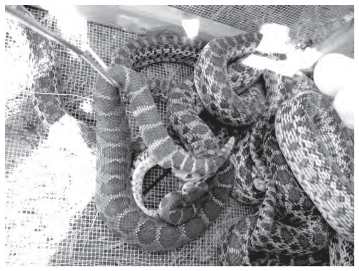
Figure 1. Pituophis catenifer and Crotalus viridis copulating.

example, the reproductive strategy of gopher snakes is oviparous while that of rattlesnakes is viviparous. Furthermore, the two species' reproductive organs (i.e., hemipenes) are morphologically dissimilar and the sex-pheromones that are elicited during oestrus and courtship behaviour may differ (Mason et al., 1989; reviewed in Houck, 2009). Once copulation takes place, unique hormones (chemical messengers) that help sperm to penetrate an egg vary between species and the maternal immunorecognition system is activated effecting fertilisation probabilities (Olsson et al., 1997). Moreover, it has been considered whether females have the ability to discriminate between sperm -sperm choice- of different hetero- and conspecific males (Olsson et al., 1996) and sperm competition in snakes is prevalent female reproductive behaviour (Schulte-Hostedde & Montgomerie, 2006).