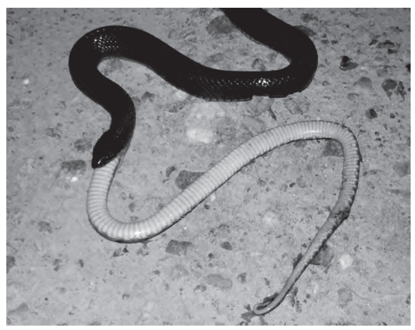
Figure 1. A male Clelia plumbea (MCN-R 3185) regurgitating a road-killed Bothrops moojeni (MCN-R 3186) at Cavalcante, state of Goiás, in a Cerrado area of central Brazil.

Colubridae) in Brazil. Phyllomedusa 4 (2), 111-122.