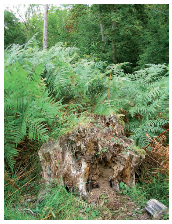
Figure 1. Hornbeam stump used as grass snake egg-laying site.