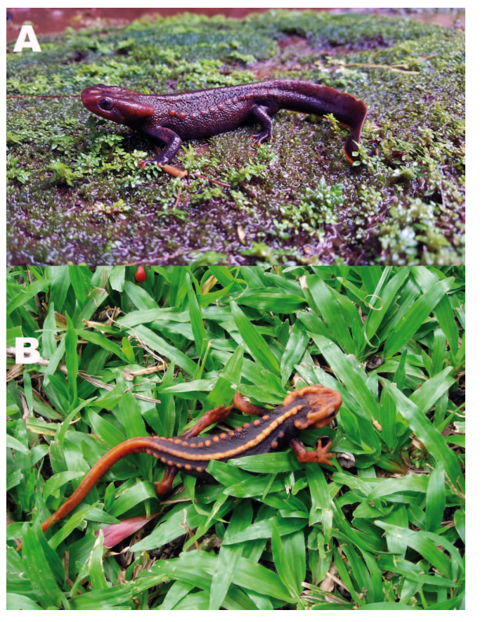
Figure 3. A . One male individual of T. panhai found in 2014 at Phu Thap Boek, Phetchabun province, north-eastern Thailand B . Specimen of T. anguliceps from Doi Lahnga range which is located 100 km south from our new locality in Si Dong Yen, Chiang Mai province, northern Thailand