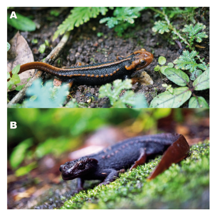
Figure 2. A. Adult male of T. uyenoi found at Doi Mon Jong, Tak province, north-western Thailand B. Specimen of T. uyenoi at Doi Mak Lang ("group II" from Hernandez, 2016a,b) which is more related to T. verrucosus topotypic from Husa, Longchuan county, Yunnan province, China

August in the same year 2014 (19°38'31.8"N 99°12'44.4"E) at 1,260 m a.s.l. We found one adult male hiding under large rocks in a dry evergreen forest near a slow-flowing stream (Fig. 3B). The air temperature was 22.1 °C with a relative humidity of 73.2 %.