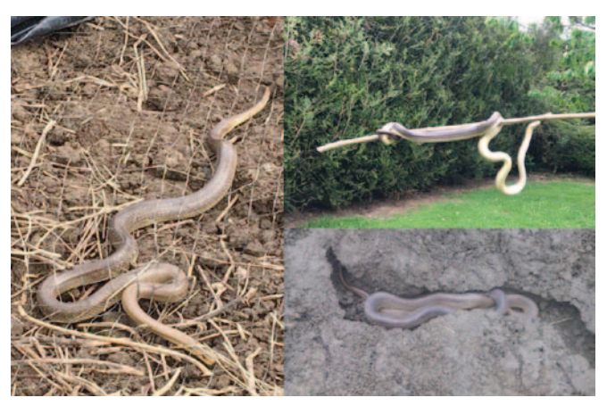
Figure 2. Some of the photos sent to us confirming the presence of Z. longissimus in Bridgend, South Wales

On the 19th September 2016, a family member of a local resident contacted us asking for help with the identification of a snake in his garden. The person in question suspected the snake to be Z. longissimus and we were able to confirm the identification from the photos that were submitted (Fig. 2). Following further investigation, it is also evident that the species was also present at nearby allotments. Close by there are several linear features, including a railway line, that may act as a route for dispersal. The species is thought to have been present for 15-20 years (based on information provided to us by residents) although it is unknown how far they have dispersed in that time.