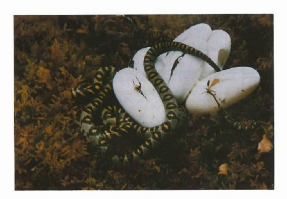
Plate 2. Hatching Elaphe mandarina