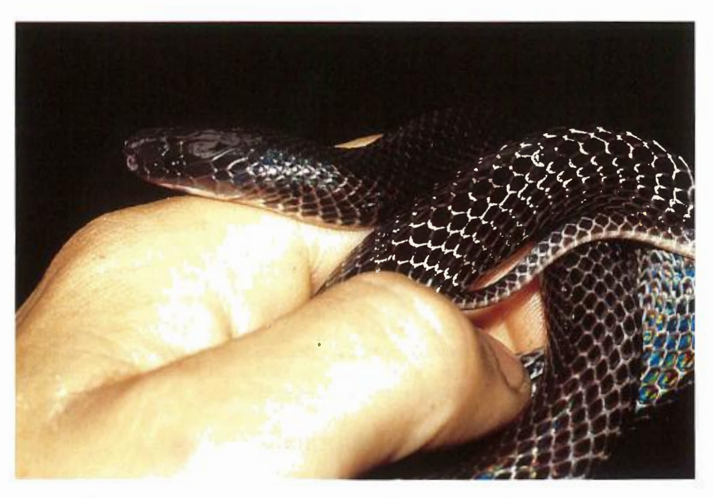
Plate 1. Mehelya stenoptakma from Ntandi, Semuliki National Park, eastern Uganda