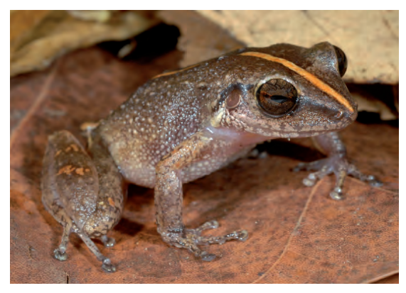
Eleutherodactylus martinicensis.