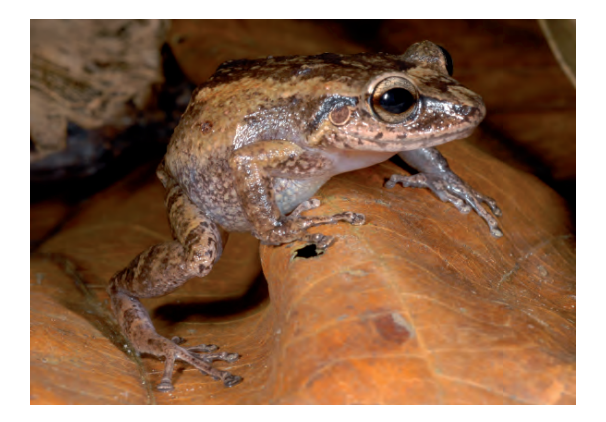
Eleutherodactylus martinicensis.