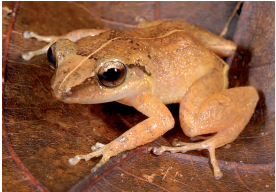
Figure 2. Eleutherodactylus martinicensis, locally called Tink Frogs, are exceedingly variable in colour and pattern. ▲ ▼