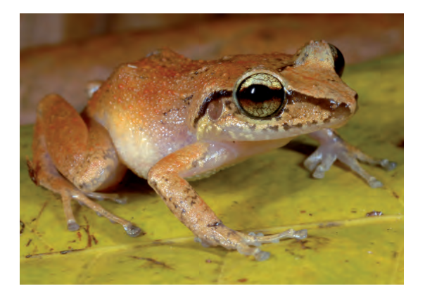
Eleutherodactylus martinicensis.