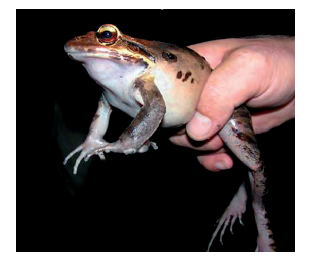
Leptodactylus fallax.