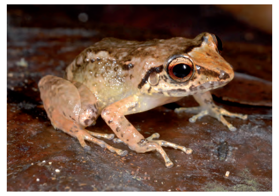
Figure 3. Eleutherodactylus amplinympha is endemic to Dominica, where it is called the Gounouj.