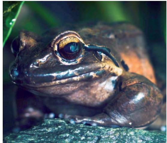
Leptodactylus fallax.