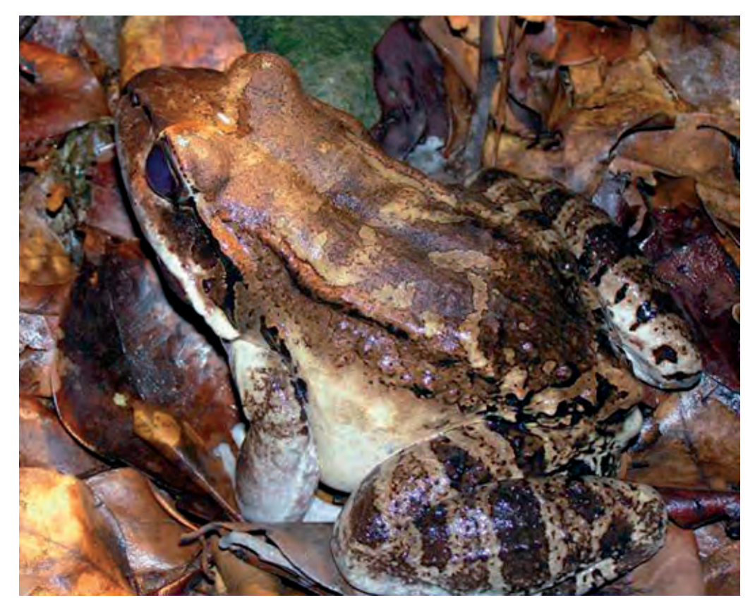
Figure 1. Leptodactylus fallax (Leptodactylidae), locally known as the Crapaud or Mountain Chicken, is native to Dominica.