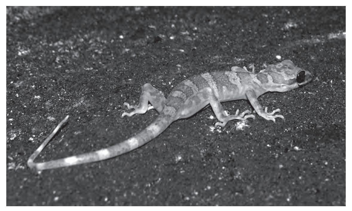
Figure 1. Cyrtodactylus sp. nov, Deer Cave, Gunung Mulu National Park.