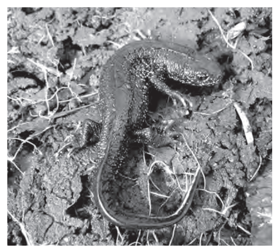
Figure 1. Triturus cristatus (Great Crested Newt).

Griffiths, R.A., Sewell, D. & McCrea, R.S. (2009). Dynamics of a declining amphibian metapopulation: survival, dispersal and the impact of climate. Biol. Cons. 143 , 485-491.