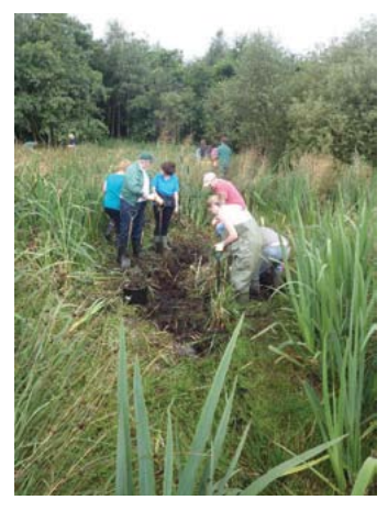
training Figure 1. Volunteers working identification, on a habitat restoration project surveying methodology and at Cardowan Moss Woodland, Glasgow, UK.

water and terrestrial habitats. Since 2010 we have worked on 410 sites improving their biodiversity value. A total of 391 species surveys have been completed on these sites involving an amazing 2,308 volunteers (Fig. 1). We do not have the in-house capacity to maintain all of these sites so in order to ensure that the work that we do is sustainable all of our projects include an extensive volunteer training package. This includes species practical habitat maintenance.