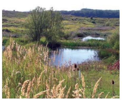
Figure 6 . Landscape at Hampton Nature Reserve.

for which species. Froglife developed an innovative project using specially adapted cameras to monitor the wildlife using these tunnels. This has resulted in Froglife supporting a PhD student since 2013 and from 2015 also a Master by Research student. Three scientific publications are expected for 2015. As these tunnels are used by other wildlife the collected data will also inform wider conservation and mitigation practices (Fig. 5 & 6).