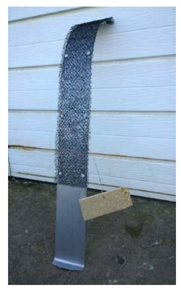
Figure 5 . Ladder design to be used in continuing 2015 trials, fitted with Enkamat® and raft.

escape. This will be trialled during 2015 (Fig. 5).