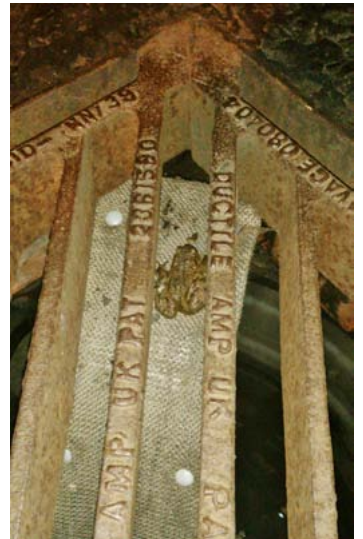
spring temperatures of less on escape ladder.

The jute provided a suitable grip for the animals to climb relatively vertical ladders. There was initial concern that the ladders may prove too steep but this was not the case (Fig. 4). B. bufo sometimes took a relatively long time to begin ascending the ladders and the duration of the ascent itself could be lengthy. It is not clear to what extent the temperature is affecting this behaviour and the time taken, although logically we would expect slower motion in early Figure 4. Common toad, B. bufo than 8°C. Most trapped McInroy, C tended amphibians to