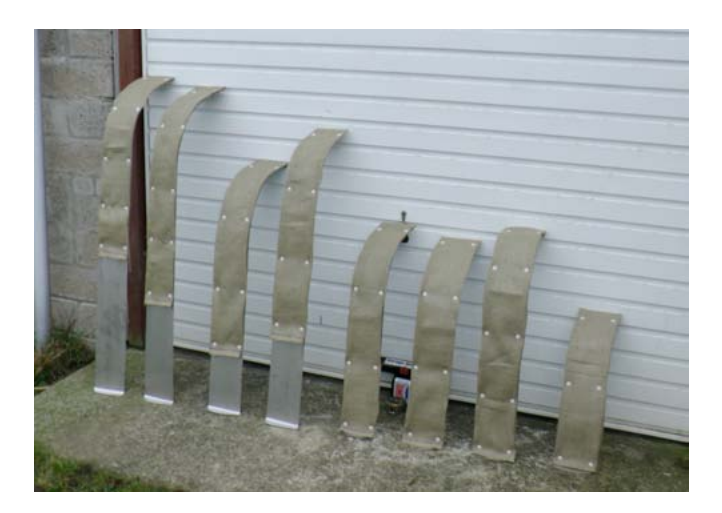
Figure 2. Selection of trial ladders.