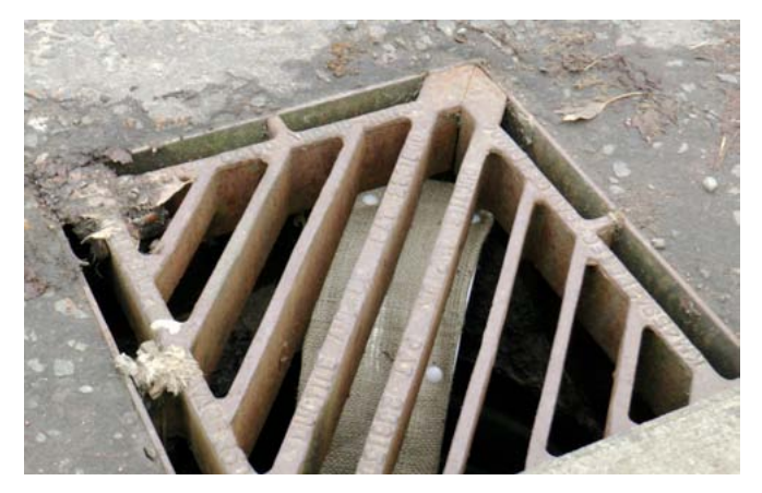
Figure 3. Ladder installed within a gullypot.

Installation of the ladders took place on the 5th March 2014. The ladder was installed such that the foot was positioned at the perimeter of the gullypot liner, and the top of the ladder then rested against the opposite side underneath the gullypot cover. It was important for the top of the ladder to be level and flush underneath the cover, and where possible, aligned with the gullypot cover grating bars (Fig. 3). This maximises