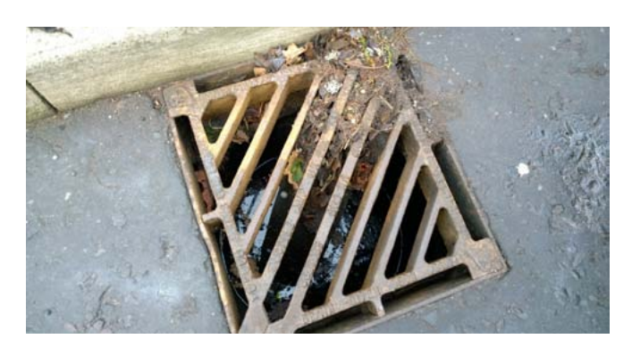
Figure 7. Leaf litter and debris build-up at the ladder top, which facilitates easier escape through the grating.

the clock (nor all parts of the site simultaneously) so the actual total number of escaping amphibians, especially frogs, cannot be quantified, but is likely to be higher than presented in the recorded data.