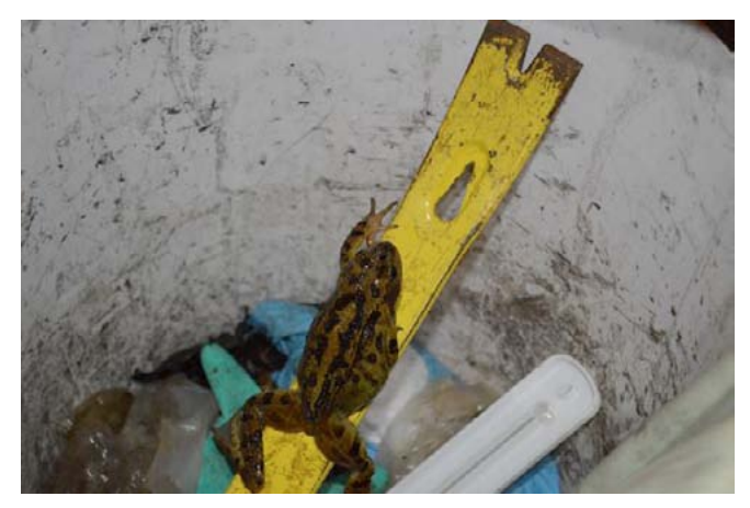
Figure 6. Frog using pry bar to escape from the collection bucket.

of laboratory trials beginning. Fig. 6 shows a R. temporaria using a pry bar as a ladder that was being carried within the collection bucket. For this reason, we consider the overall results of this study and the data collected to be conservative, as it was not practical to attend the site around