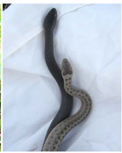
Figure 3. Melanistic C. austriaca next to a cryptically coloured specimen.

The earliest record of a melanistic smooth snake in Britain dates from the 19th century and until recently was considered an anomaly (Cambridge, 1894). More recently there have been further records (Pernetta & Reading, 2009; Woodley, 2015) increasing the total to four, all from Dorset (Fig. 4).