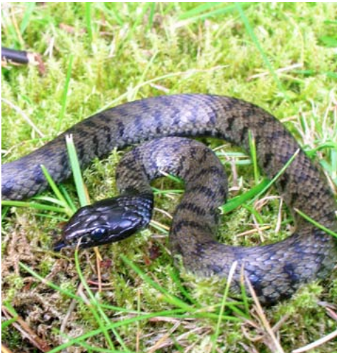
Figure 2. Melanistic N. n. helvetica.