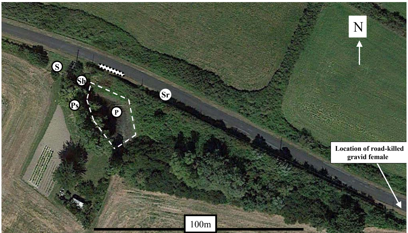
Figure 1. Aerial view of the study area showing localities of the nesting location (dotted line at roadside), artificial nests (Sr = roadside in sun; S = sunny; Ps = partial sun; Sh = shade), pond (P) and location of a road-killed gravid female N. natrix . See text for further details. In this Google Earth view the pond next to the nesting area appears dried out, which is usually from June onwards.