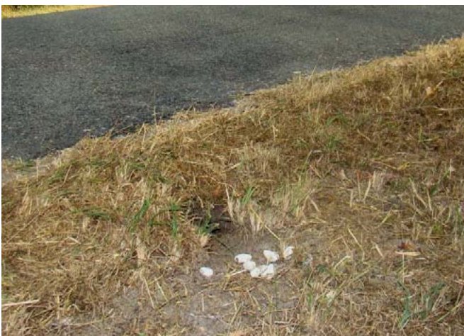
Figure 2. Example of a roadside nest, one of the two nests located in 2014, which has been excavated by a predator

reading than the Koch instrument for use with passing traffic.