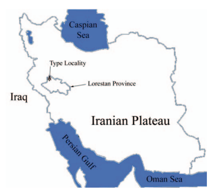
Figure 1. Distribution map of X. luristanicus sp. n. in western Iran (Badavar region, Nourabad, Lorestan Province)

LSRab: longitudinal scale rows at anterior body; LSRmb: longitudinal scale rows at mid-body; LSRpb: longitudinal scale rows at posterior body; TSR: transverse scale rows at mid-body; SRR: scale row reduction (longitudinal or transverse); SC: subcaudals; LOA: total length (mm); W: mid-body diameter; TL: tail length; TW: mid-tail diameter; SIP: supralabial imbrication pattern; INS: inferior nasal