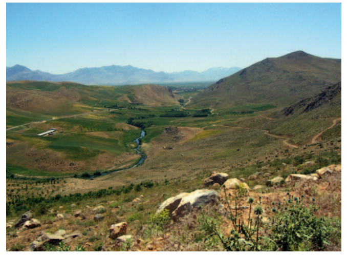
Figure 3. Habitat of X. luristanicus sp. n. at type locality, Badavar, Nourabad, Lorestan, Iran

Some differences between the skull bones of X. luristanicus sp. n., X. vermicularis and I. braminus were identified. In general, nasal, supraoccipital, and occipital