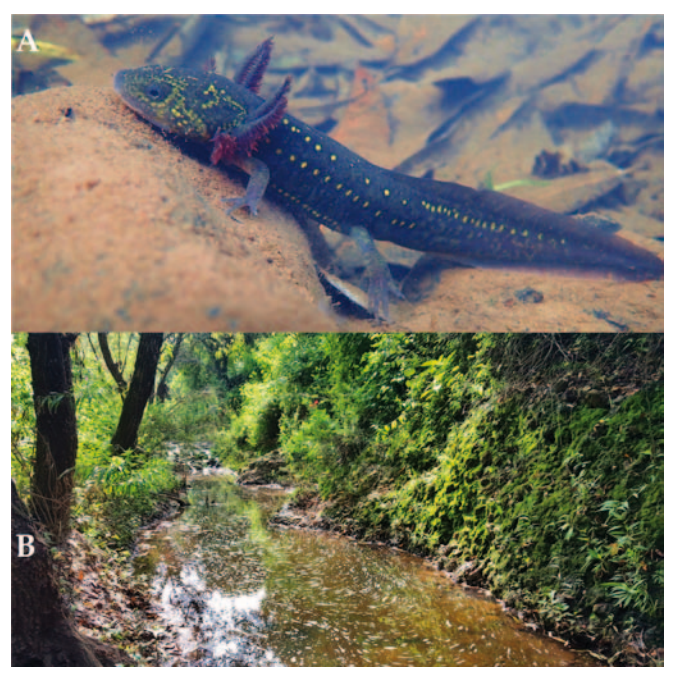
Figure 2. A. adult neotenic male of A. ordinarium , B. habitat of the target species at Rio Bello, Michoacán, Mexico

TL – total length, SVL – snout vent length, HW – head width, HL – head length, IOW- interorbital width, IEW- internarial width, FL – forelimb length, HLL – hindlimb length , GL –gill length