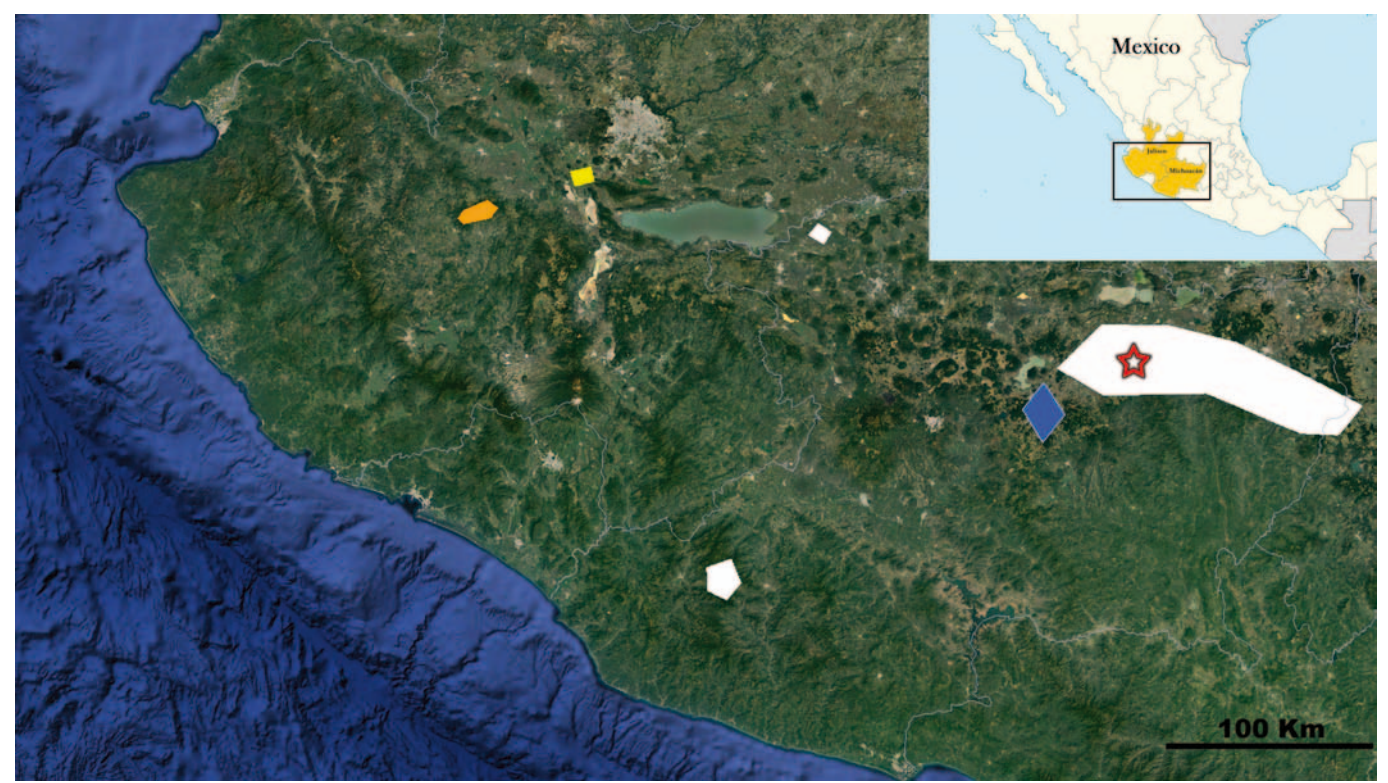
Figure 1. A map of Mexico showing the main distribution of A. ordinarium and A. flavipiperatum . White area: A. ordinarium ; red star: Rio Bello (this study); blue area: A. ordinarium sp.; Yellow area: A. flavipiperatum type locality; Orange area: Sierra de Quila (this study)