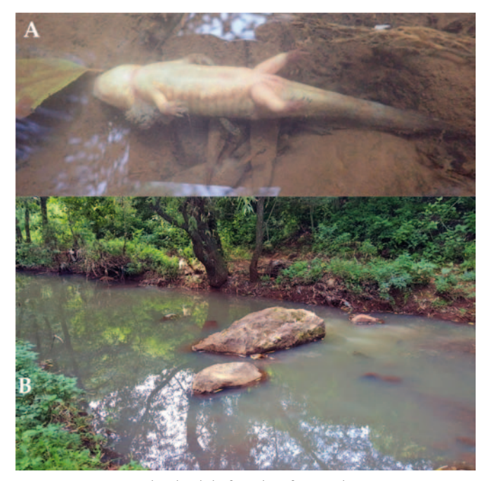
Figure 3. A. one dead adult female of A. ordinarium , B. picture showing degradation and flow changing of the main stream where the species was previously known to occur at Rio Bello. Dead specimens were found in the vicinity of this site.

Abies religiosa, Pinus leiophylla, Pinus michoacana, Quercus castanea, Quercus crassifolia, and partially some subtropical shrubs such as Acacia farnesiana, Acacia pennatula, Eysenhardtia polystachya, and Ipomoea arborescens (Fig. 2B). At the time the air temperature was 22.9-26.7 °C and water temperature 19.0-19.2 °C. The stream had a rocky substrate and the water quality was slightly alkaline (pH 7.92-8.06) with dissolved ions between 301-306 mV. The specimen was confirmed as male by the presence of a rounded cloaca. The number of costal grooves and physical dimensions of this specimen are shown in Table 1. Its general coloration was black with small yellow spots on the dorsal and ventral surfaces. Gills were prominent beside the head and had a reddish purple hue. We also photographed two dead females within the same stream 600 m below a road under construction (Fig. 3A & 5B). We noticed the presence of a dam nearby that may have affected the flow and quality of the stream water (Fig. 3B). This suggests that the development of Morelia city is having a negative impact on the habitat of A. ordinarium.