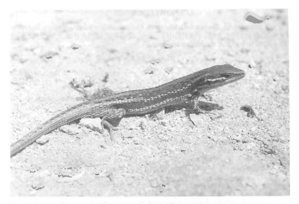
Plate 1: Psammodromus microdactylus , adult male, Balcon d'Ito (loc. 8), 1964.

specimens were found sunning between 8 and 9 G.M.T., among tufts of Palmetto scrub ( Chamaerops humilis ) on stony calcareous slopes overgrazed by cattle, just east of the road P21 between Azrou and El Hajeb. The species seemed to be scarce at the time we were looking for it since we all three searched between 7 and 11 G.M.T. but found only four animals. The landscape was a plateau with few cultivated fields and large areas of short grass. This habitat in Morocco is called "erme" (cultivated erme) (Ionesco and Sauvage 1962).