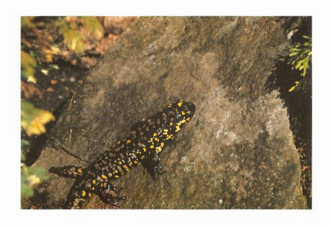
Plate 2. Salamandra salamandra crespoi, adult male, Foia