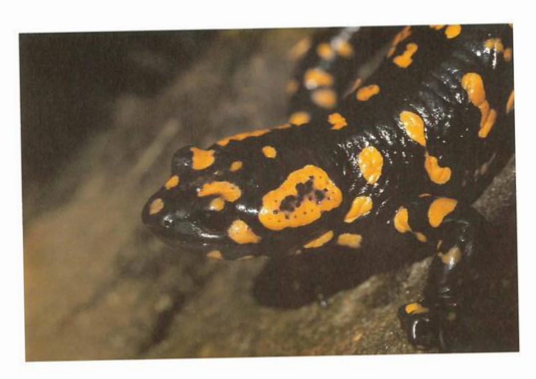
Plate 3. Salamandra salamandra crespoi, portrait of adult male, Foia