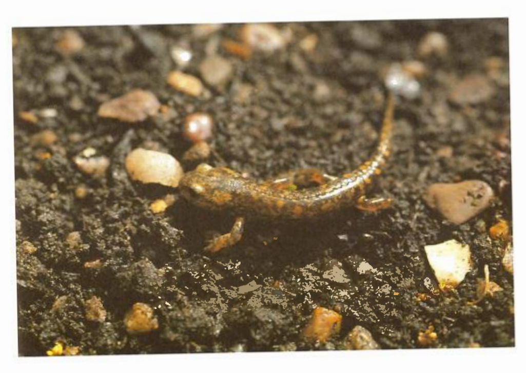
Plate 4. Early metamorphosed juvenile of Salamandra salamandra crespoi, note the absence of adult colouration