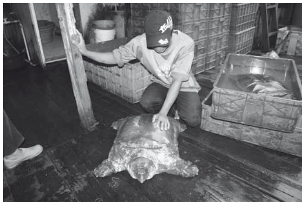
Fig. 1. Asiatic Softshell Turtles Amyda cartilaginea in an exporters' warehouse in Indonesia.

individuals in trade in these areas are A. cartilaginea . Amyda cartilaginea in the meat-trade are sold by weight, with individuals bought by the kilo and turn-over reported in tonnes. We converted weights to individuals by employing an 'average' weight of live A. cartilaginea in trade (~5 kg) as observed at the trader's facilities (Fig. 1).