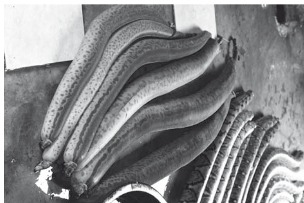
Fig. 5. Filesnakes Acrochordus javanicus filled with water before the skin is removed.

As a result, harvest and export continue to greatly exceed quotas, and according to many individuals involved, this has resulted in significant local declines in traded species, indicating that harvest levels are unsustainable. Although