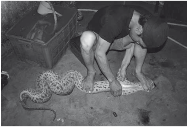
Fig. 3. Skin being removed from a Filesnake Acrochordus javanicus .

obtain fewer filesnakes than in previous years and that the average size of harvested filesnakes was smaller.