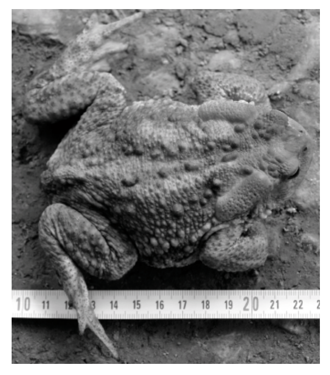
Fig. 2. Bufo eichwaldi from Shirabad.

The distribution of B. eichwaldi was modeled using 16 Iranian and 36 Azerbaijan georeferenced localities (Fig. 1). The geospatial layers were downloaded from the WorldClim 1.4 database (1950–2000; ~1 km resolution; <u>http://www.worldclim.org/current</u>). The distributional model for B. eichwaldi was generated by MAXENT 3.3.3k (Phillips & Dudík, 2008). MAXENT was used with default settings (Convergence threshold= 0.00001, maximum number of iterations=500 and \beta_j =0), partitioning the geographical records between training and test samples (75% and 25% respectively). In order to avoid highly correlated and redundant climate variables in our dataset, we estimated the correlation between pairs of variables using the Pearson correlation coefficient in ENMTOOLS 1.3 (Warren et al., 2008). Variables sharing