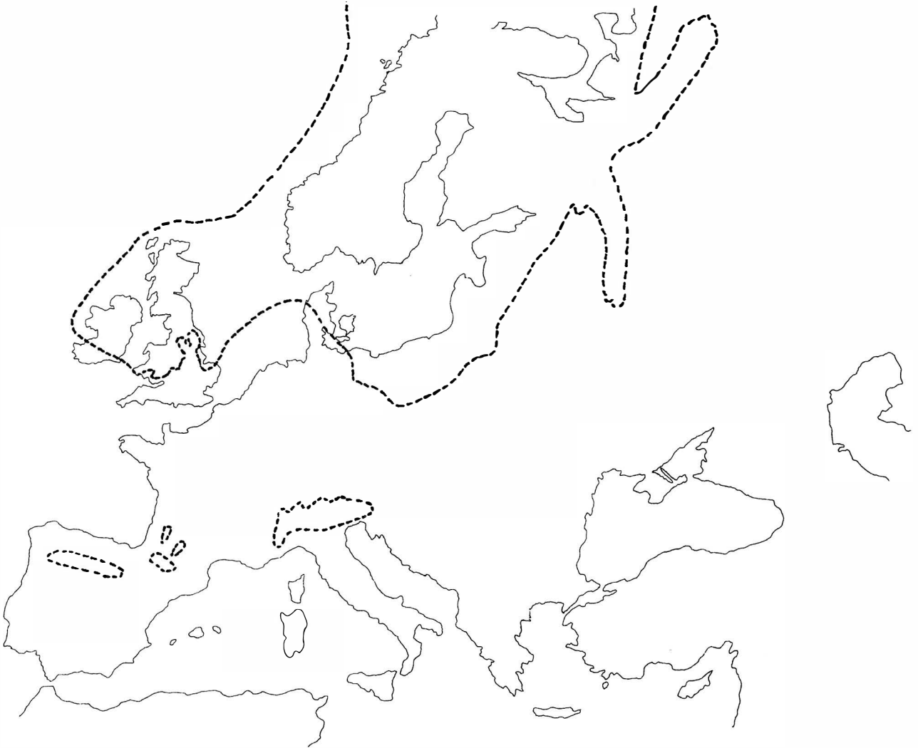
Fig. 1 Approximate distribution of the ice (areas enclosed by broken line) during the time of the Devensian glacial expansion about 18,000 BP. Britain and Ireland appear as they are today. (Modified from Sutcliffe, 1985).

herpetological habitats. During the succeeding Wolstonian glaciation possible herpetological habitats were again greatly restricted, but not to the extent as in the Anglian.