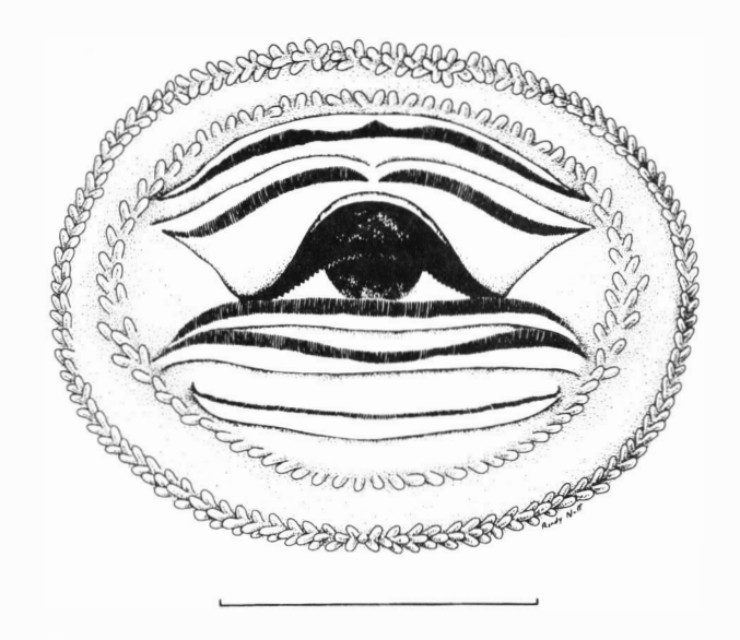
FIG. 2. Oral disc of the tadpole of Plectrohyla dasypus (lot USNM 513859) in Gosner stage 40. Scale bar = 3 mm.

A typical tadpole (lot USNM 513859) in stage 40 (Gosner, 1960) has a body length of 15.6 mm, a tail length of 33.2 mm, and a total length of 48.8 mm. The tadpoles in this lot may be described as follows (Fig. 1): body slightly depressed, slightly wider than high; snout semicircular in dorsal aspect, rounded in profile; eyes small (eye length/body height ca. 0.24), directed dorsolaterally; interorbital distance ca. 3.8 mm; nostrils