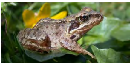
Common frog

All enquiries should be sent to herp.symposium@gmail.com