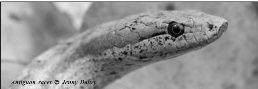
Antigua racer