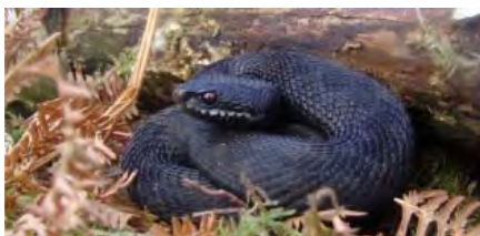
Black adder © Paul Smith