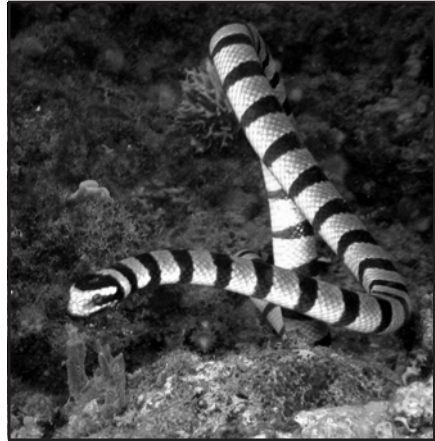
Banded sea snake

To test this hypothesis, the scientists turned to a population of sea snakes in the tropical Pacific, in which members of the same species ranged from jet black to