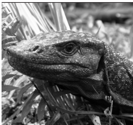
Varanus bitatawa © Elga D. Reyes