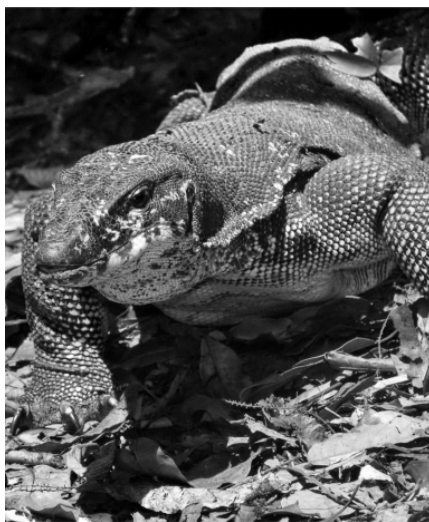
Varanus palawanensis © Ingo Langlotz

The three new Philippine monitors were identified based on examination of numerous preserved voucher specimens in various major European natural history museums, in combination with long-term studies in the field. This demonstrates the immense importance of museum collections as an archive for global biodiversity. ❖ Source: Science Daily