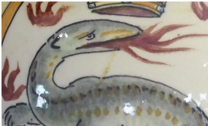
Figure 7. Blois Salamander painted on vase © Martin Johnson

The Asian water monitor Varanus salvator , on the other hand, is the most common species of monitor lizard, occurring all through the southeast from India and Sri Lanka to Malaysia, Indonesia, Borneo and the Philippines - the widest range of any species. These are the second largest species of monitor after the Komodo Dragons and often attain a length of 3 metres, and a weight of more than 25 kg. They have five claws on each foot, heads with snouts that taper towards the nose, and jaws that hinge behind the eye sockets with pointed teeth. They all sense with their tongues which flick in and out, so the flames coming out of the mouth of some Salamander sculptures (Figs. 1, 7) could be an embellishment of the monitors' forked tongue giving the impression of flames (Fig. 8), especially if seen when covered in blood after a kill.