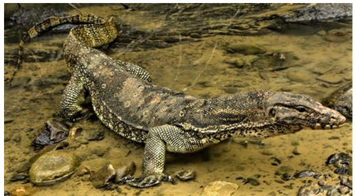
Figure 9. Asian Water Monitor Varanus salvator

The 16 th Century bestiary of Yi yu tu zhi describes travels far from China and records many races of people and types of animal from around the world, including a zebra and a lama, showing that Chinese explorers had reached Africa and the Americas, making China a very plausible source for the image that ended up being presented as the Salamanders of King François.