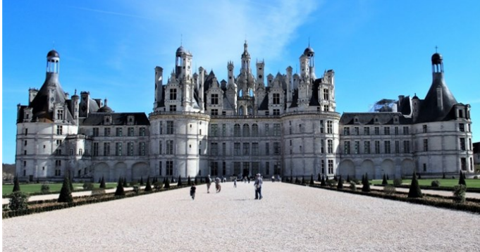
Figure 1. Chateau de Chambord

King François 1 of France (1515 - 1547) chose as his personal emblem the mythical Salamander. This creature was fearsome, believed to be fireproof and its poison was the deadliest known to man. 1