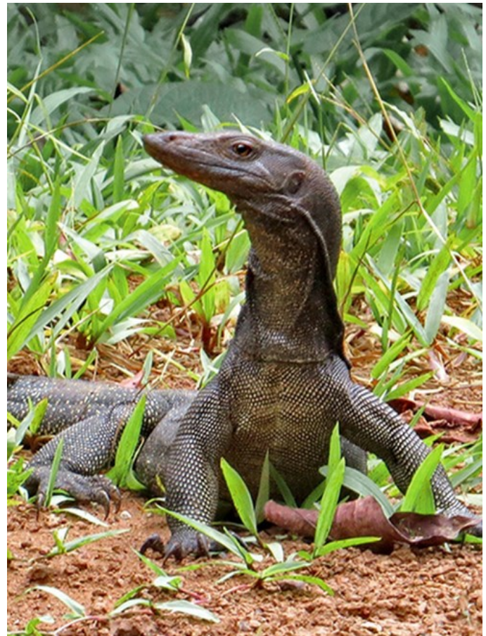
Figure 5. Rasmussen's Water Monitor Varanus rasmusseni

Rasmussen's Water Monitor Varanus rasmusseni (Fig. 4) is only known from the Southern Philippines islands (Tawi-tawi Jolo and Bitinan) and is much smaller (up to 1.2 metre length), though its resemblance to the Salamanders is striking.