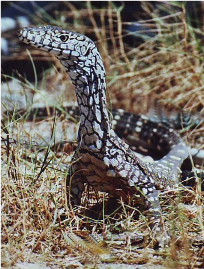
Figure 6. Perentie Lizard Varanus giganteus