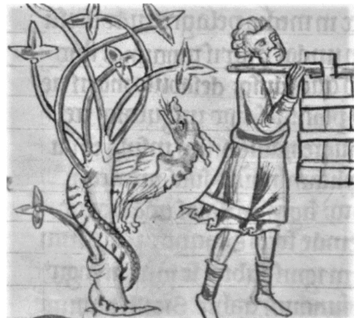
Figure 3. Mediaeval Salamander: (courtesy, Corpus Christi College Cambridge: Isidore of Seville ms022 fl65r)

word salamander is itself derived from ancient Greek, and the conceptual source for the mythical salamanders is undoubtedly Pliny the Elder, who attributes them in turn to Aristotle (4 th Century BC). The Salamander images of King François appear more reptilian due to having five claws on each foot (four pointing forward), scutellations running down their backs and long neck and tails (Figs. 2,10).