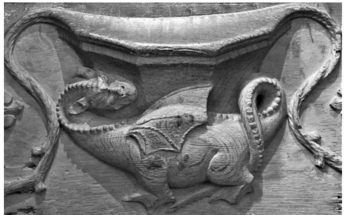
Figure 4. Dragon, St David's Cathedral, 15 th /16 th C

Could they have been based on mediaeval dragon imagery? There are many contemporary dragon images in European art, but all are distinctly different from the Salamanders of King François.