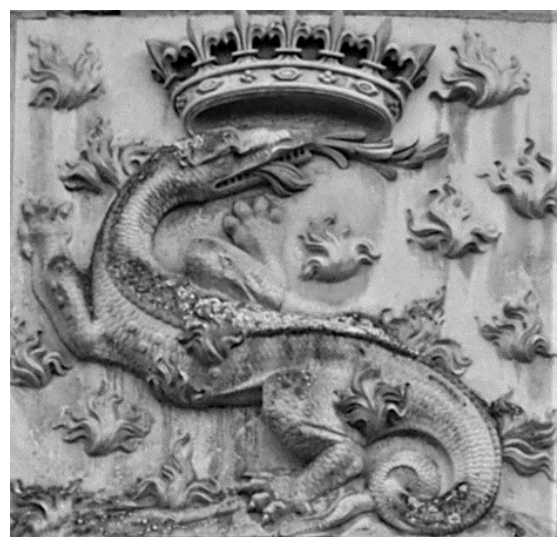
Figure 10. Salamander, Chateau Royal de Blois (exterior)