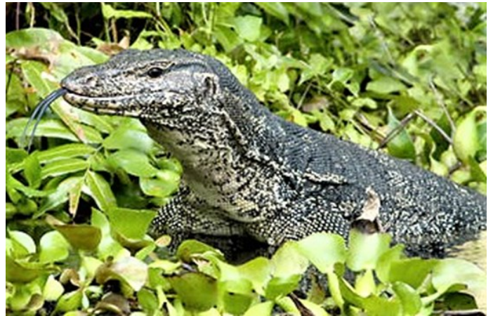
Figure 8. Asian Water Monitor Varanus salvator showing tongue

The Asian water monitor Varanus salvator , on the other hand, is the most common species of monitor lizard, occurring all through the southeast from India and Sri Lanka to Malaysia, Indonesia, Borneo and the Philippines - the widest range of any species. These are the second largest species of monitor after the Komodo Dragons and often attain a length of 3 metres, and a weight of more than 25 kg. They have five claws on each foot, heads with snouts that taper towards the nose, and jaws that hinge behind the eye sockets with pointed teeth. They all sense with their tongues which flick in and out, so the flames coming out of the mouth of some Salamander sculptures (Figs. 1, 7) could be an embellishment of the monitors' forked tongue giving the impression of flames (Fig. 8), especially if seen when covered in blood after a kill.