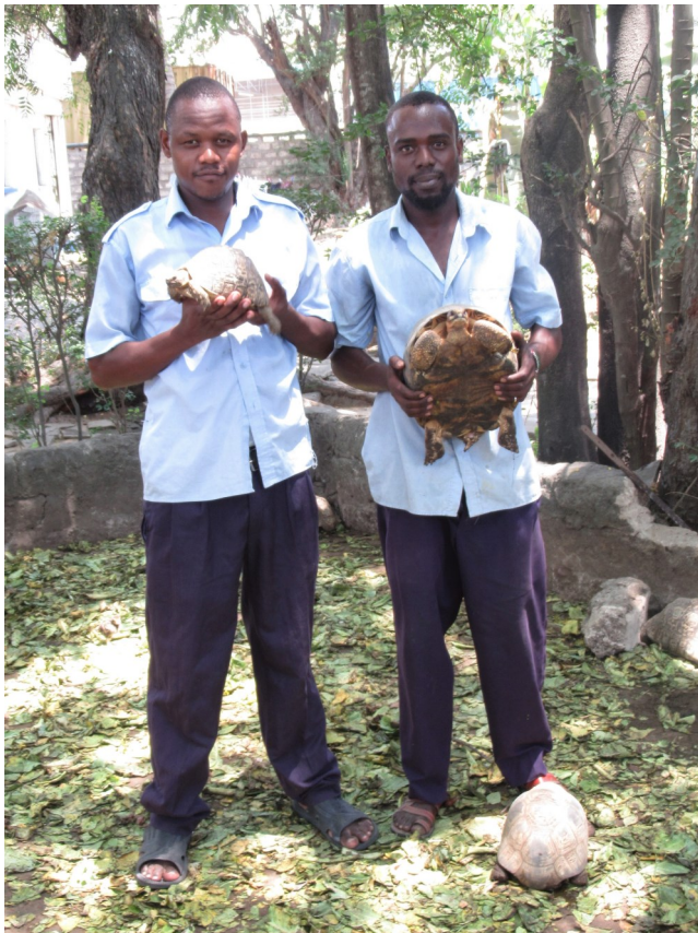
Figure 1. Tortoises are handled by staff for examination.

We first lived in Kenya fifty years ago, from 1969-1973. We have retained close links with that country, even when based elsewhere in East Africa, Arabia, the West Indies and Britain. Since 2002, we have been returning to Kenya two or three times a year to provide teaching and training on subjects ranging from domestic livestock to birds of prey and primates, but our focus has been reptiles. In all our activities in Kenya over nearly twenty years we have laid particular emphasis on working with and training local people, ranging from veterinary surgeons and students to reptile keepers, technicians and attendants. We are largely self-funded – we cover our own flights and much of our in-country expenses - but have been able to expand our work on chelonians thanks to the generosity of the British Chelonia Group (BCG) and the Dr Robert Andrew Rutherford Trust (see, for example, Cooper and Cooper, 2012, 2014), and a kind donation from Dr John Ballany.