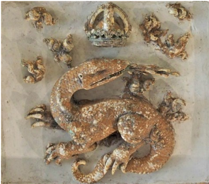
Figure 2. Salamander carving, Chambord, interior

Two of his Loire Valley palaces, the Chateau de Chambord (Fig. 1) and Chateau Royal de Blois between them have hundreds of Salamander images represented in various sculptures and paintings (Fig. 2).