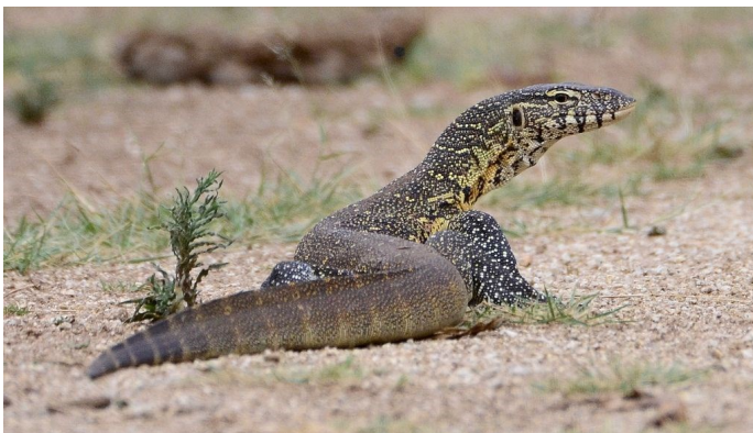
Figure 11. Nile Monitor Varanus niloticus

Closer to France, however, are the two monitor species found in Northern Africa, the Nile Monitor Lizard, V. niloticus , and the Savannah or Bosc Monitor Lizard, V. exanthematicus (named after French scientist Louis Bosc 1759-1828). Nile Monitors are usually seen up to around 2 metres in length, but may grow to 2.44 metres. The Savannah or Bosc Monitor normally grows to around 1 metre, but can reach 1.5 metres. The former is largely aquatic and the latter terrestrial. Both are venomous to small animals but not usually dangerous to humans and both could easily have been held in French collections of African animals even in the 16th century AD. V. exanthematicus has a short snout compared to V. salvator or V. niloticus , making it a less likely prototype. The prominence of ridges above the eyes in the carvings varies, so Figure 10 more closely resembles the head of V. salvator in Figure 9, while the head of V. niloticus (Fig. 11) more closely resembles the head of the vase painting in Figure 7. Both these species have been seen with a wide degree of variation in markings and colouration.